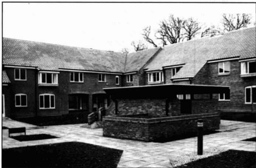
Hanover Court ready for occupation 1980

Here we are into February after the cold and icy weather of January. It's so nice to see lighter evenings, the bulbs appearing and to realise that spring is on the way. The major event this month is Valentine's Day – a busy time for the florist and a happy time for all lovers, young and old.